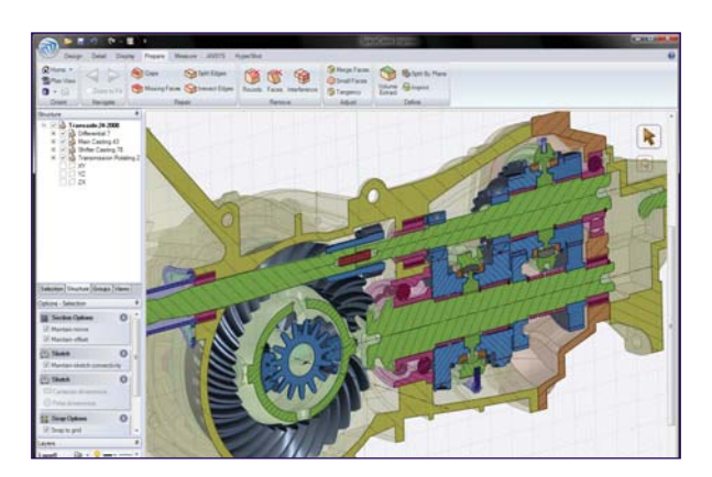
SpaceClaim's Pull, Move, Fill, and Combine tools let you work in 3D and cross sections to create new design concepts using existing data from any CAD system.